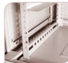
Sliding mounting angles