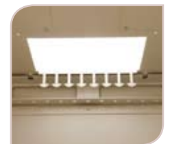
Cable strain relief positions