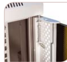
Quick release door