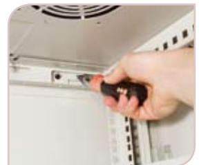
Internal fixing to ensure safety