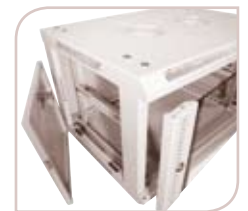
Lockable side panels