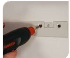
Wall mount bracket