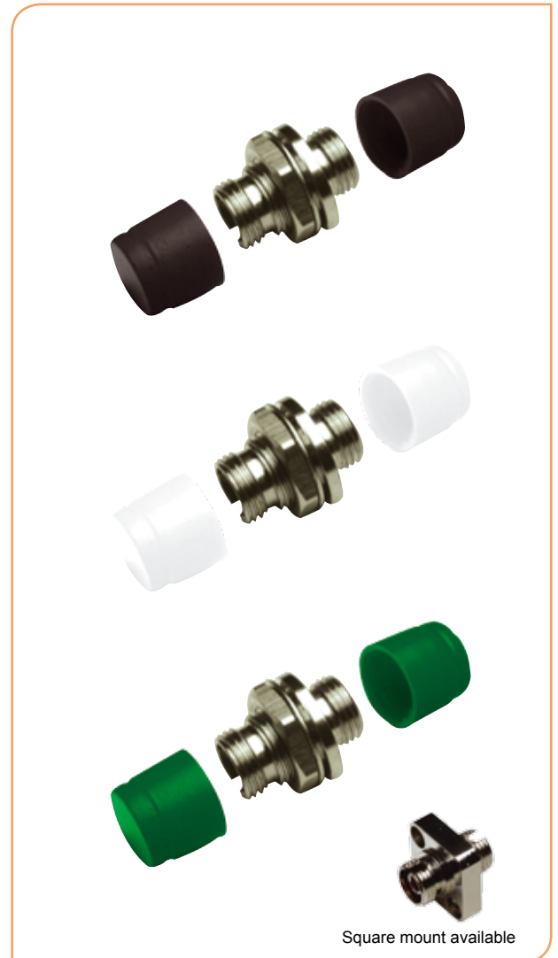
Square mount available